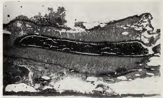
Figure 3.—Longitudinal section of a spermathecal receptacle of Oligoxystre argentinensis filled with sperm mass.

Results indicate that a given palp is able to inseminate either or both spermathecal receptacles in O. argentinensis . Unexpectedly, there is no evidence of morphological or ethological constraints which prevent a palp from delivering sperm to either receptacle. Our findings also suggest that sperm are directly deposited by the embolus deep into the spermathecal receptacles, since females were sacrificed soon after mating and no immediate sperm transfer mechanisms along the spermathecae are known. The increased receptacle lumen width in filled spermathecae resulted from the stretching (expansion) of the spermathecal wall rather than the reduction of wall thickness. Finally, the low insemination level observed in the second series lead us to suspect that these males had difficulties recharging the palpal organs after their first copulations. One